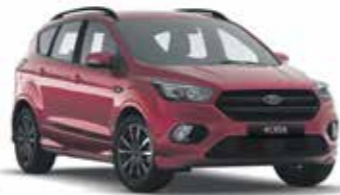
Ruby Red (Metallic*)