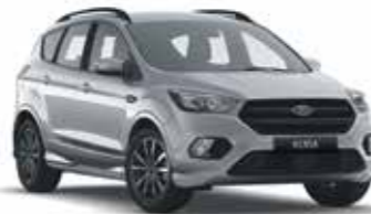
Moon dust Silver (Metallic*)