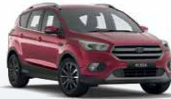
Ruby Red (Metallic*)