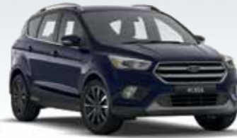
Blazer Blue (Solid)