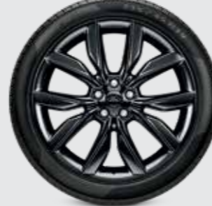
19" 5x2-spoke Alloy wheels Available on ST-Line