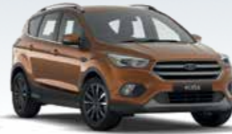
Copper Pulse (Metallic*)