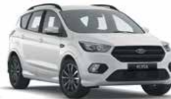
Platinum White (Metallic*)

*Metallic body colours are optional, at extra cost.