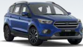
Blue Metallic (Metallic*)