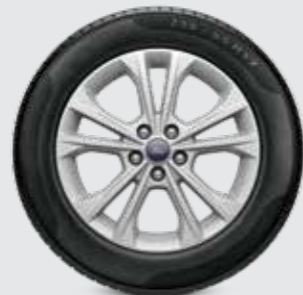
17" Alloy wheels – 235/55 R17 Standard on Trend