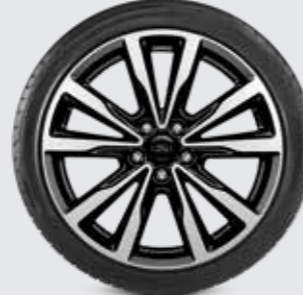
18" Dual-tone Alloy wheels – 235/50 R18 Standard on ST-Line and available as an option on Trend