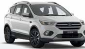
Platinum White (Metallic*)