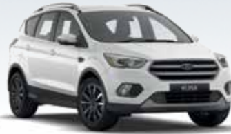
Frozen White (Solid)