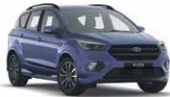
Blue Metallic (Metallic*)