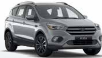
Moon dust Silver (Metallic*)