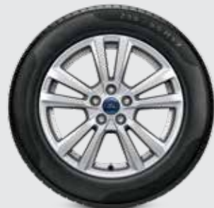
17" Alloy wheels – 235/55 R17 Standard on Ambiente